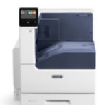
Xerox® VersaLink® C7000 Color Printer