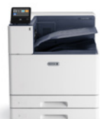
Xerox® VersaLink® C8000 Color Printer