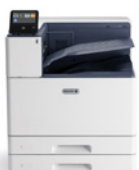
Xerox® VersaLink® C9000 Color Printer