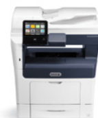
Xerox® VersaLink® B405 Multifunction Printer