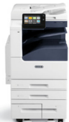
Xerox® VersaLink® C7020/ C7025/C7030 Color Multifunction Printer