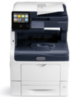
Xerox® VersaLink® C405 Color Multifunction Printer